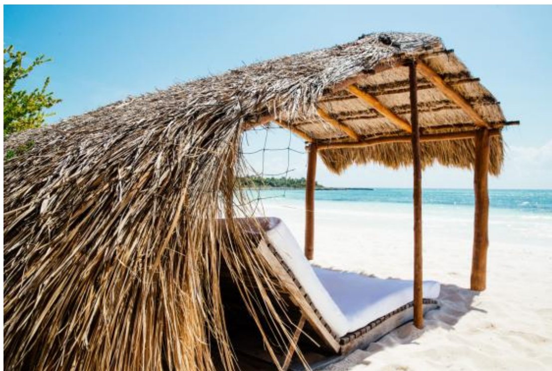
A beach cabana

Any downsides? A lot of seaweed is currently blowing in from Sargasso and piling up on the otherwise pristine beach, but Esencia has a team of guys working round the clock to clear it up and keep you view Instagram-perfect.