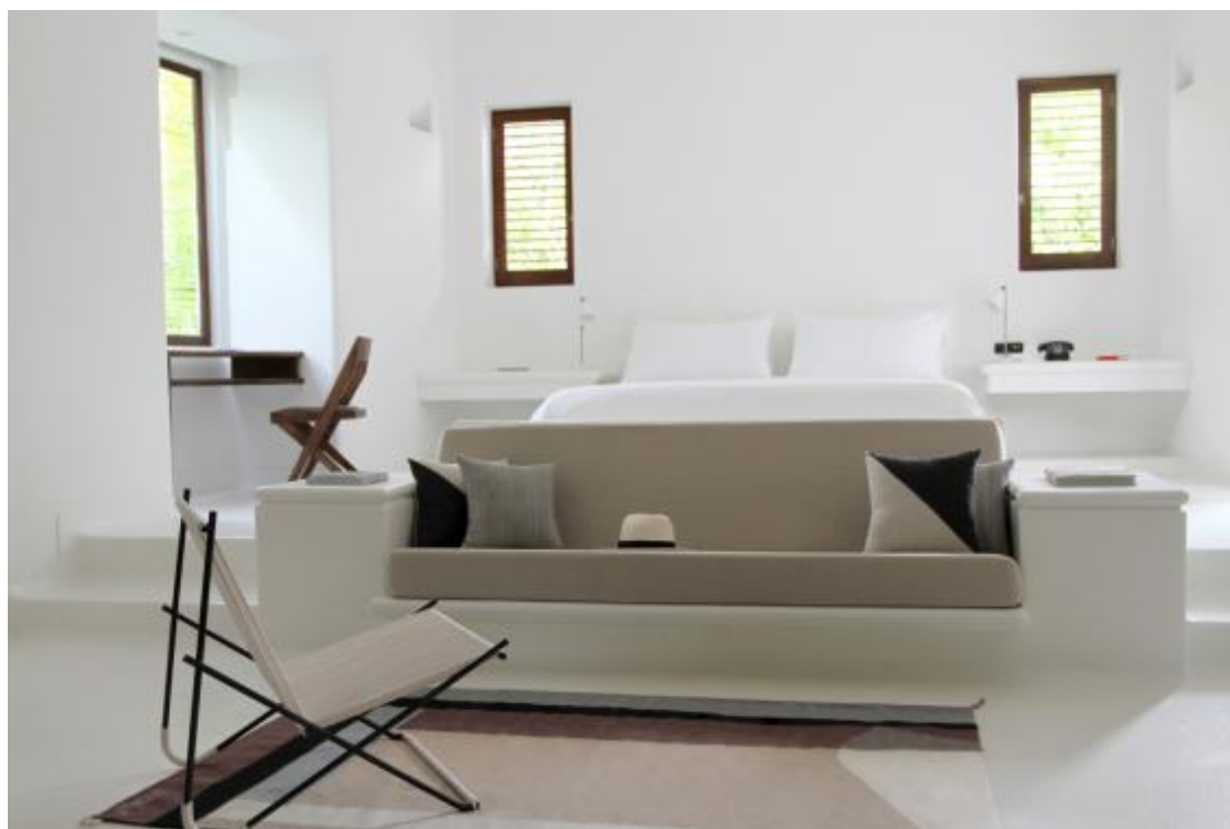
Chic all-white interiors with midcentury details

The guest rooms are characterised by chic and minimal all-white interiors with drops of colour afforded by sofas, chairs and stationery. Carefully curated contemporary art and design books are joined by custom handwoven rugs from Mexico which you'll want to take home and luxurious Italian bed linen.