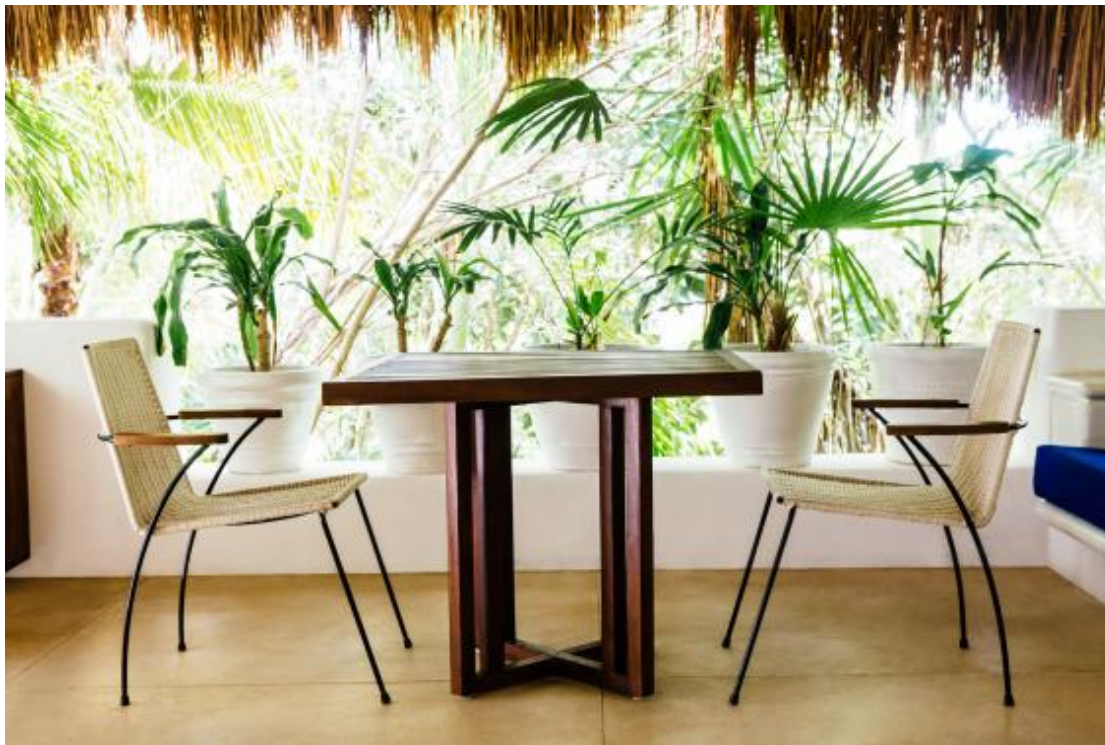
Private terrace attached to a garden suite

you've rinsed the day's sand off and a minibar with complimentary water and juices. Your room will also come with Havaianas (ours both fit perfectly despite not having given our sizes) and a stripy beach bag. There are lots of extra lovely touches like the turn down service, where staff leave little presents on your bed like illustrated postcards and little chocolate turtles.