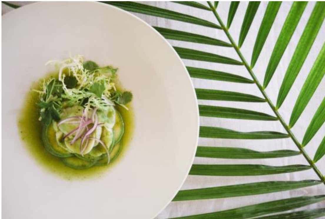
An avocado dish from the Esencia restaurant

Then it was back to the beach, waiting until it was acceptable to order our first margarita on the rocks. For lunch we'd order plates of fish ceviche, grilled prawns, fish tacos and bowls of fresh guac to our sun loungers. The ultimate in luxury.