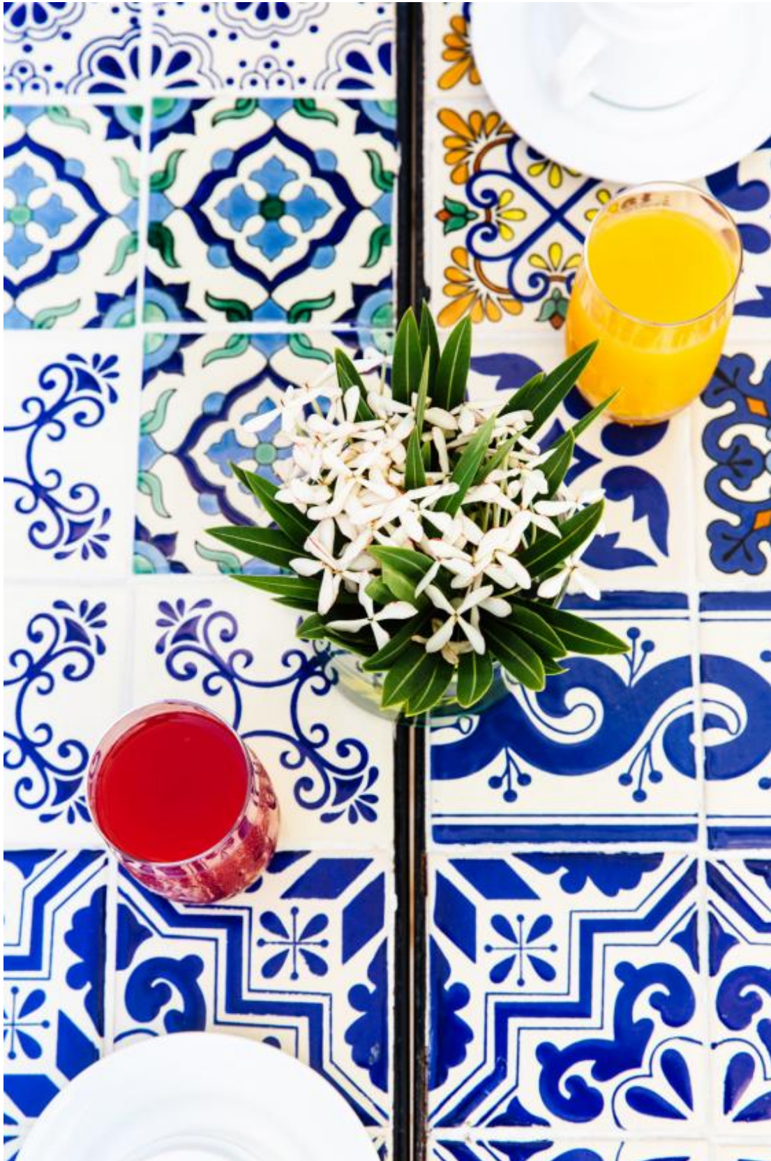
Juice against a backdrop of pretty tiles at breakfast

saunter a few yards back to the poolside restaurant for breakfast, part two: fresh juices, Greek yoghurt with stewed fruit and homemade granola - or eggs and bacon if we were feeling hungrier.