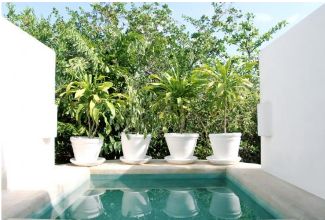
Private plunge pool in a garden suite

Which room? We stayed in a garden suite which was a secluded oasis of bliss. A short few minutes from the beach and pool, our top floor suite had a big terrace with a sofa for two and a table for pre-dinner cocktails and late night card games, a spacious bedroom and a bathroom with a separate double shower, dressing room and the piece de la resistance: a vast glass door which slid back to reveal our private plunge pool. A square of pale turquoise surrounded by whitewashed walls and planters which can be heated up on request - it just takes a dial of the retro telephone to your concierge.